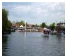
THE NORFOLK BROADS

GREAT YARMOUTH NORFOLK & SUFFOLK NORWICH & THE BROADS