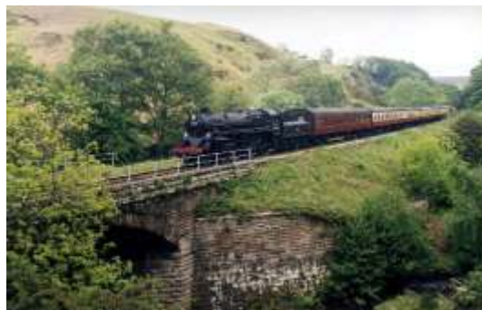
NORTH YORKSHIRE MOORS RAILWAY