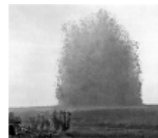
HAWTHORN RIDGE MINE