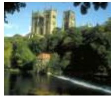
CITY OF DURHAM